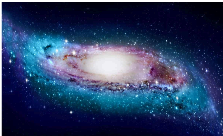
Photo: An artist's impression of the Milky Way galaxy.

Outer Space is a colourful and abstract subject to work with as an artist! A galaxy is made up of a system of stars, stellar remnants, interstellar gas, dust and dark matter. There are an estimated 2 trillion galaxies in our universe! Today we are going to create our own galaxy artwork using simple techniques. Choose your colours and let's get started.