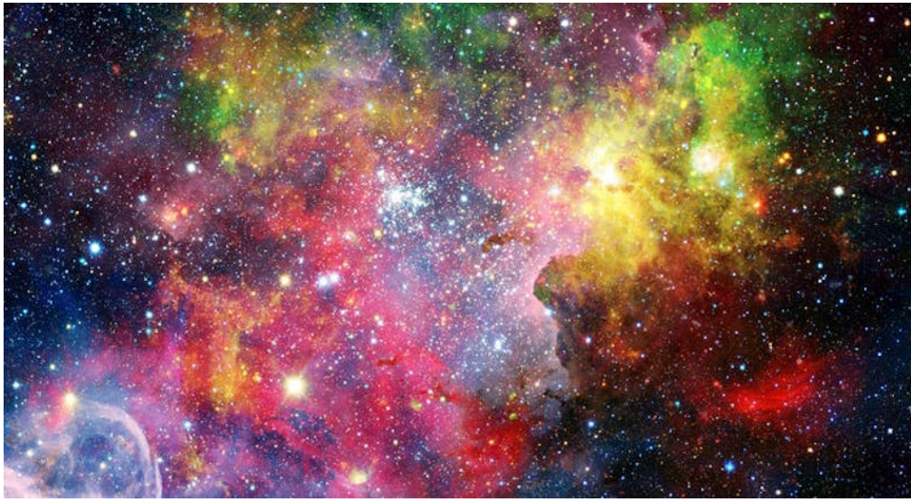
Photo: An enhanced image of galaxy clusters.

Outer Space is a colourful and abstract subject to work with as an artist! A galaxy is made up of a system of stars, stellar remnants, interstellar gas, dust and dark matter. There are an estimated 2 trillion galaxies in our universe! Today we are going to create our own galaxy artwork using simple techniques. Choose your colours and let's get started.